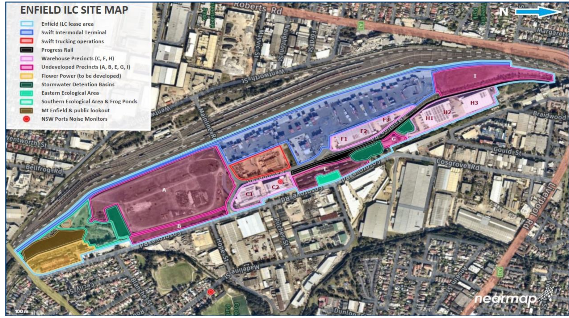
Figure 1: Enfield ILC Layout