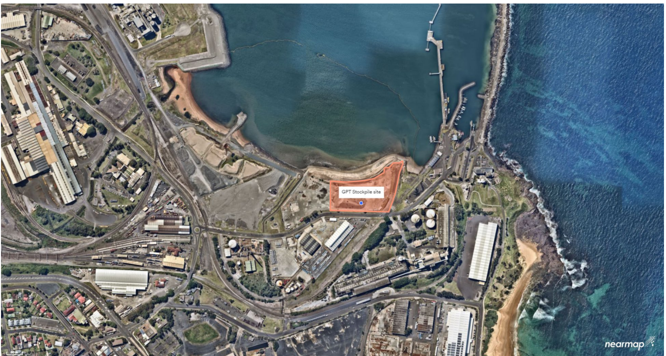
Figure 1. Location of premises to which Environment Protection Licence No. 21652 applies

NSW Ports is required to report material pollution incidents immediately to the EPA, NSW Health, SafeWork NSW, Wollongong City Council and Fire & Rescue NSW. “ Immediately ” has its ordinary dictionary meaning of promptly and without delay.